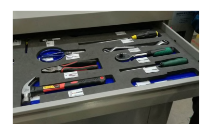
Xerafy RFID for Tool Tracking Aviation Tool Control Smaller Tools Rail Construction