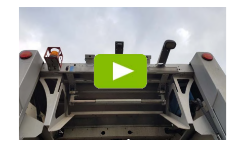
More Case Studies