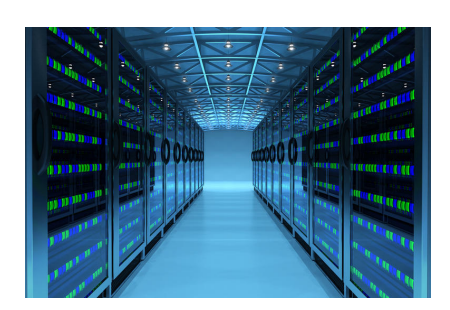
Xerafy RFID for Data Center Automation IT Asset Inventory IT Vendors