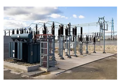
Xerafy RFID for Waste Management Weapon Tracking Telco Towers Smart Grid